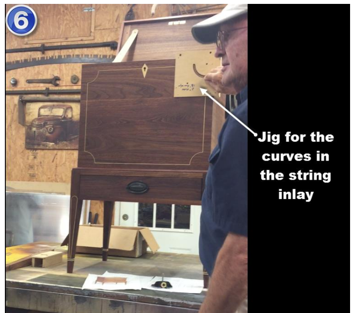
Jig for the curves in the string inlay