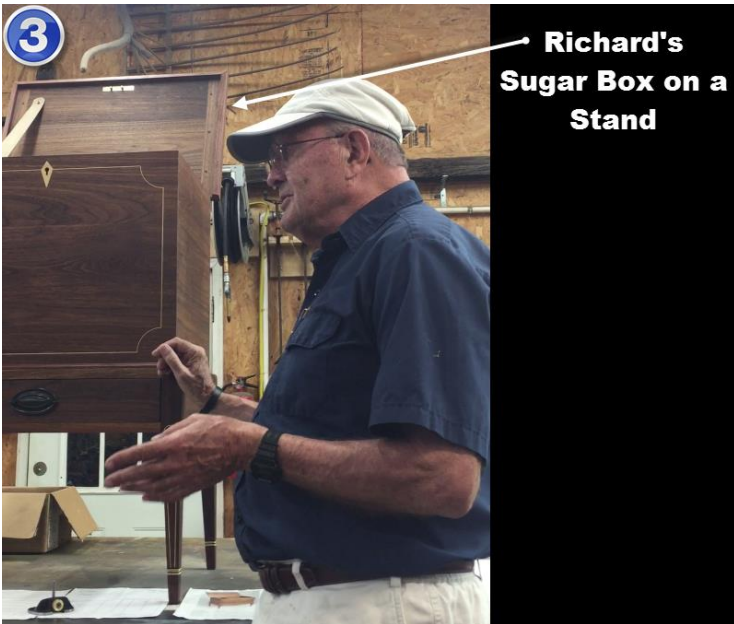
Richard's Sugar Box on a Stand